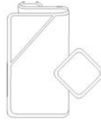
HOODED TOWEL & WASHCLOTH