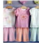
T-SHIRTS & PANTS