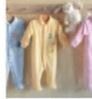
SLEEP & PLAY